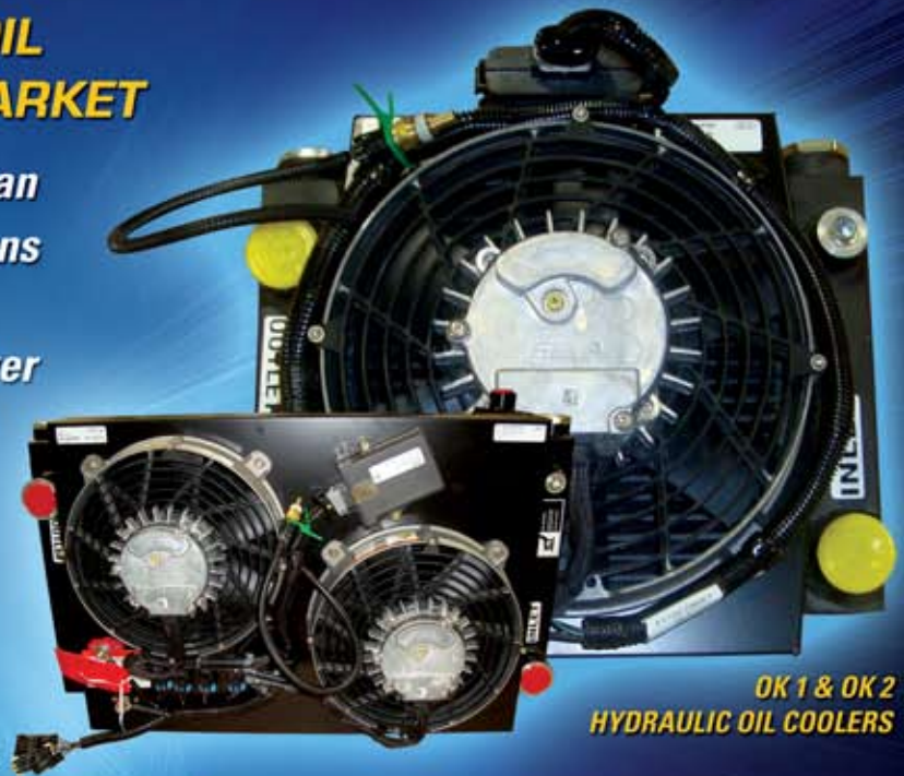
OK 1 & OK 2 HYDRAULIC OIL COOLERS