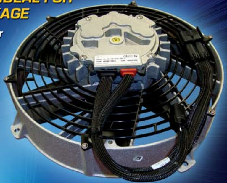
FiL-15 Electric Fan